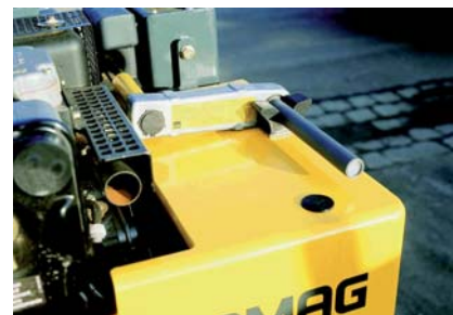
Simple and reliable to start Electric starter and hand starter