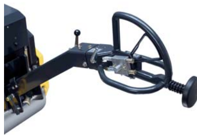
Precise and save to operate All function integrated in the steering rod head