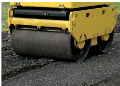
Higher compaction power and surface quality BOMAG double vibration